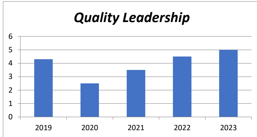
Figure 1. Achievement of Santri Leadership Interests

However, the fact is that in carrying out the duties and responsibilities as a potential leader. Researchers found several problems that occurred. Among them, Islamic boarding school administrators do not understand their job descriptions and operational standards, so there are defects in carrying out their mandate. Therefore, with the NJ Trainer, the organization under the auspices of the Nurul Jadid Islamic Boarding School is able to develop and improve organizational capabilities as well as productivity and work teams. The following data contains the results of the researcher's research.